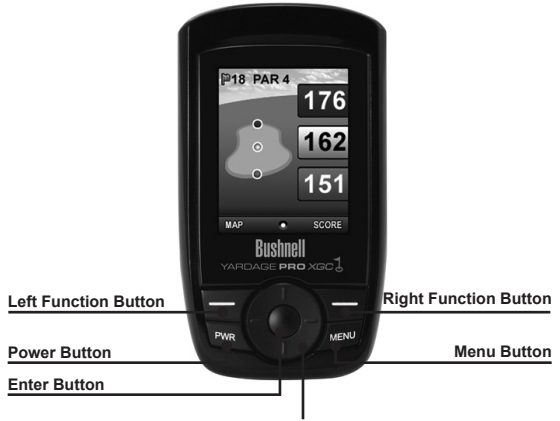
Up / Down / Left / Right Toggle Buttons