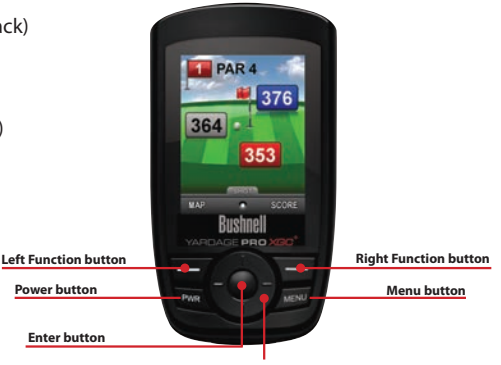
Toggle Pad buttons (Up/Down/Left/Right)